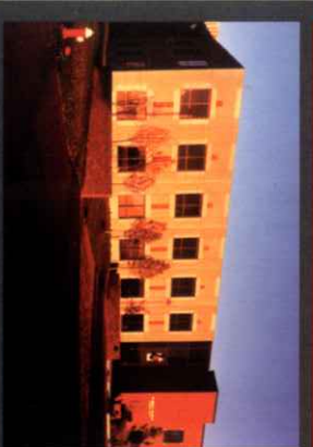
The Robert M. Scott Operations Center