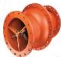
Ventex® Float Valve