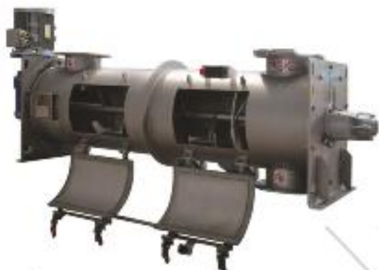
PLOUGH SHEAR MIXERS