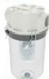
See Through Liquid Separator