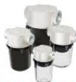
Extreme Duty Vacuum Filters