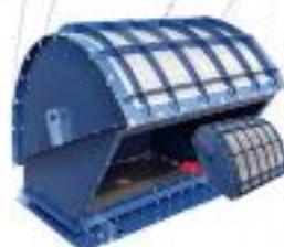
Explosion Relief Vents