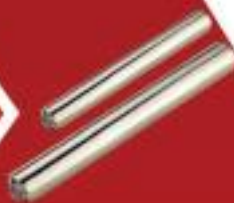
Magnetic Grate – Square/Round shape