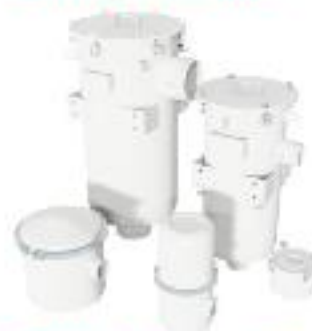
Oil Mist Exhaust Filters