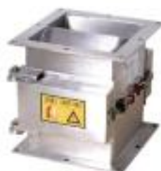
Plate Housing Magnet