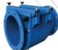
Redex® Flap Valve