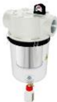
Medical Vacuum Filters