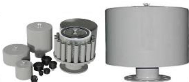
Inlet Filter Silencers

SOLBERG® Filtration • Separation • Silencing