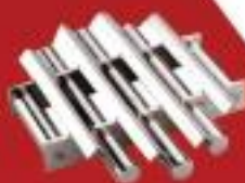
Easy - Cleaning Magnetic Grate (Square Type)