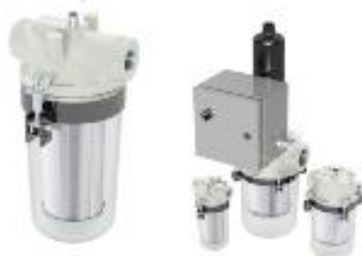
Reverse Pulse Vacuum Filters