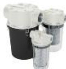
Vacuum Filters "T" Style