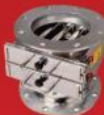
Rotary Grate Magnetic Separator