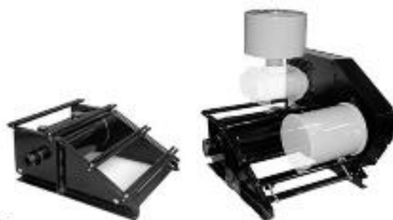
Silencer Base Frames