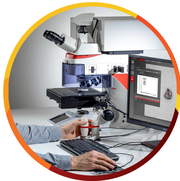
Laboratory & Inspection Equipment

PT Fajar Mas Murni provides complete professional services to its customers throughout Indonesia, including - but not limited to laboratory and inspection equipment, construction and mining equipment, industrial technology equipment and services, rotating equipment, project / package equipment and process equipment.