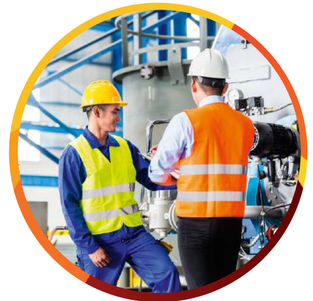
Industrial Technology Services