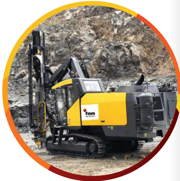
Construction & Mining Equipment

PT Fajar Mas Murni provides complete professional services to its customers throughout Indonesia, including - but not limited to laboratory and inspection equipment, construction and mining equipment, industrial technology equipment and services, rotating equipment, project / package equipment and process equipment.