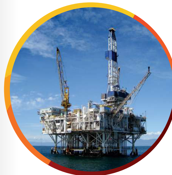
Project / Package Equipment