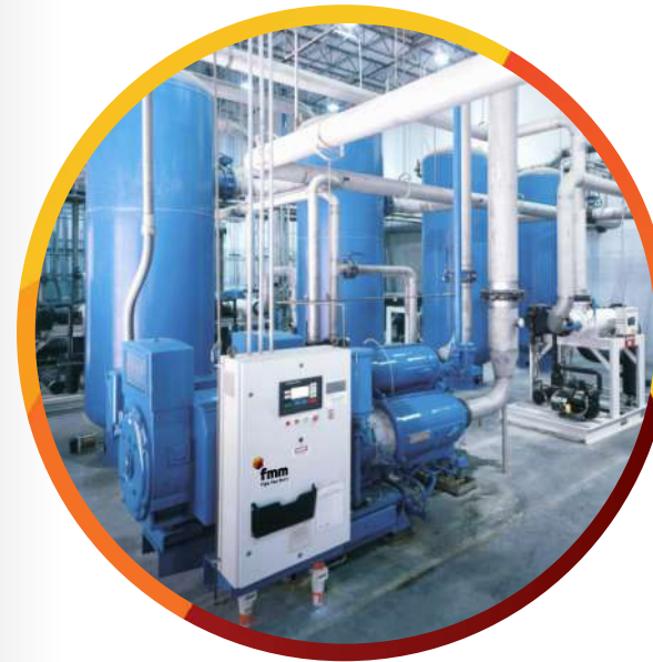
Industrial Technology Equipment