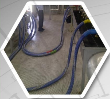
Flextraco Composite Hose