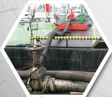
Transflex OSD 20 Bar Implemented when Loading & UnLoading