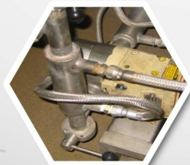
Tokyoflex Flexible metal Hose Implemented at Candy Factory