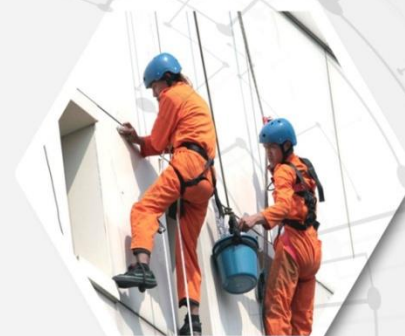
Be Safe Body hardness in application