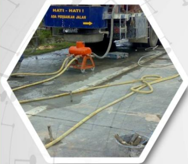
IVG Montana 20 Implemented during at Road Asphaltting