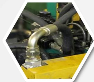
Marutek Hydraulic Hose Implemented at Automotive Industri