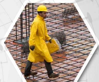
Be Safe Rain Coat in application

With sincere dedications, efforts and commitments, we have successfully gained trusts and served some major industries nation-wide and keep expanding.