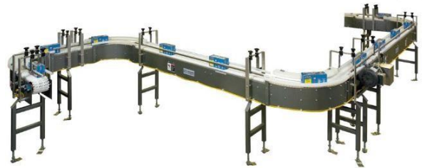
Coztumized Conveying System