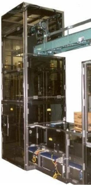
Case Elevator (or Lowerator )

ELPACK can be suplied packaging equipment, costumized solution design and manufactured to specfication : Case Elevator, Conveying system, Shuttle Car, Counting system, Feeding system, etc.