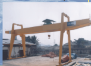
Outdoor Mobile Crane System