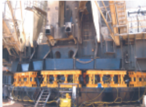
Synchronized Lifting of Mining Dragline