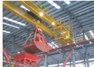
"Grab Buoket" Crane System