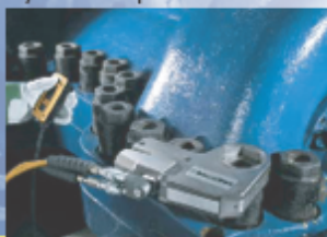
Hydraulic Torque Wrench