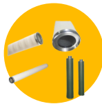
COALESCE & SEPARATOR CARTRIDGE

Brother Filtration, a prominent player in the water filtration industry, manufactures top-notch cartridges and filter housings that combine quality with cost-effectiveness. Our extensive product range caters to diverse industries, ensuring we have the right solution for every need. With over 50 types of high-flow cartridges, we're well-equipped to address a wide array of challenges.