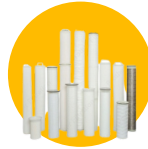
HIGH FLOW FILTER CARTRIDGE

Always provides you with new trend products and new filtration solutions