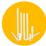
DEPTH FILTER CARTRIDGE

Diverse choice and wide range of applications