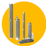
METAL FILTER CARTRIDGE

Offering you high-performance and cost-effective membrane as substitutes for..