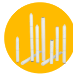
DEPTH PLEATED FILTER CARTRIDGE

Higher economic efficiency, shorter lead time