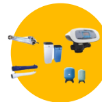
SYSTEM SPARE PARTS

Higher quality in order to meet your higher requirements