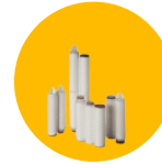
MEMBRANE PLEATED FILTER

Practical and durable, high quality and high capacity