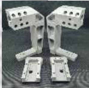
Support Holder Center