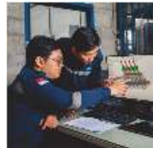
DESIGN ENGINEERING & CNC SOLUTION