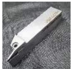
Cutting Tool Holders