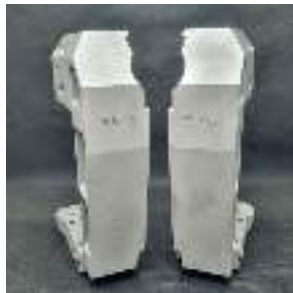
Jig Clamp Holder