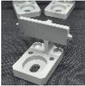
Cigarette Feeder Plate