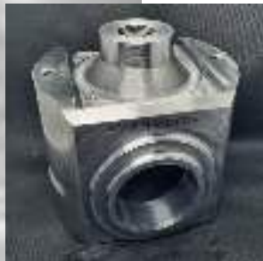
Piston Cross Head