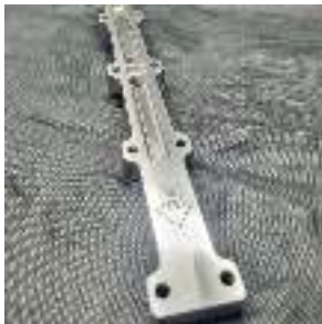
Glue Inject Cover