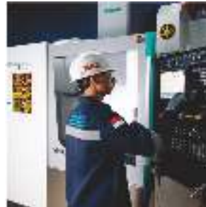
CNC MOLD & DIE SPECIALIST