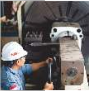
MARINE & MANUFACTURING SERVICES SPECIALIST