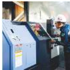
MASS PRODUCTION SPECIALIST