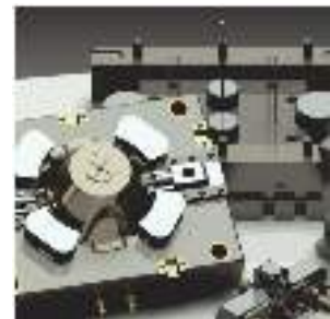
JIG & FIXTURE SPECIALIST