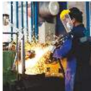
THERMAL SPRAY SPECIALIST