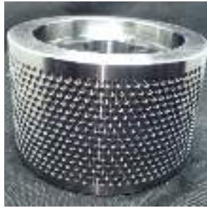
Rotary Mold Pill