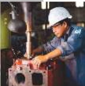
HEAVY DUTY EQUIPMENT SPECIALIST