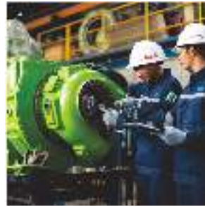
BALANCING & TURBOCHARGER SPECIALIST