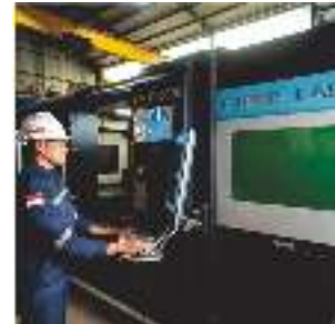
LASER CUTTING SPECIALIST