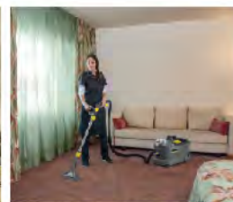
Hotel & Hospitality