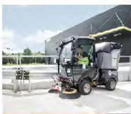
Public Services and Municipal Equipment