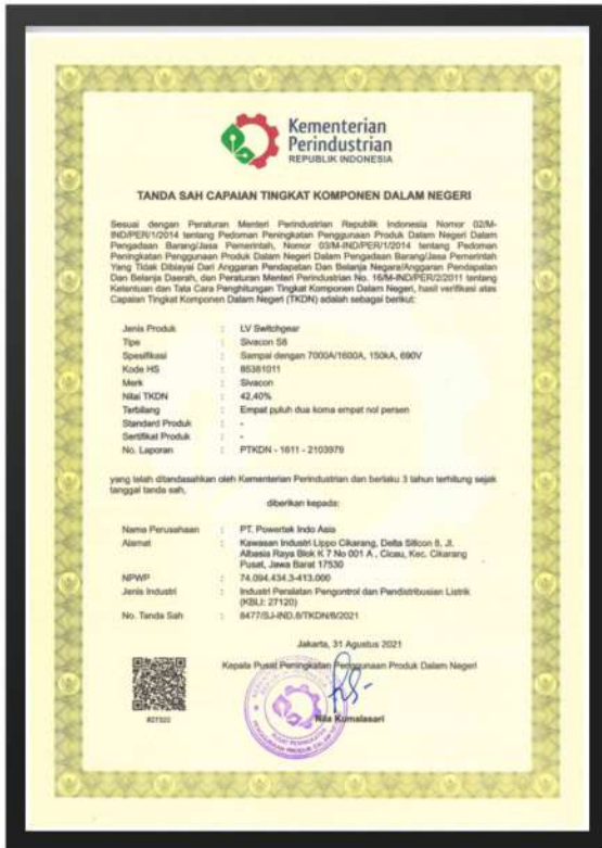
TKDN SIEMENS SIVACON S8