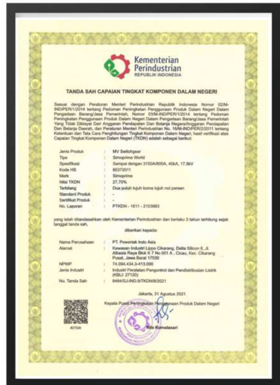
TKDN SIEMENS SIMOPRIME WORLD