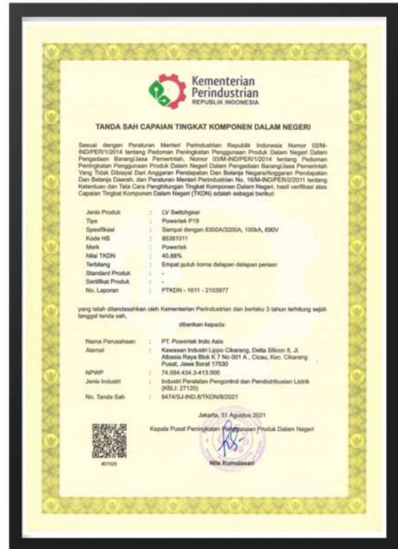
TKDN POWERTEK P19