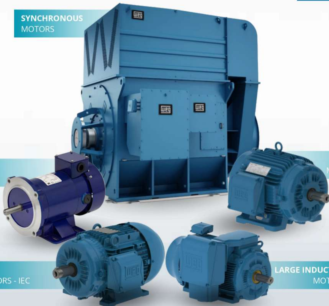
LARGE INDUCTION MOTORS